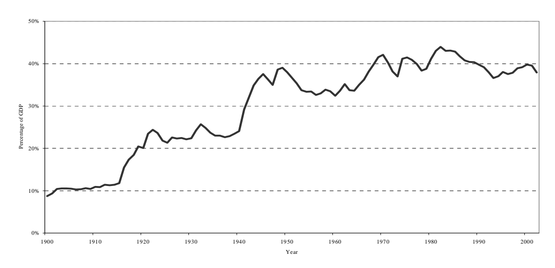
Figure 1: Government receipts as a proportion of GDP, 1900–2002

Note: Figures are for general government net receipts.