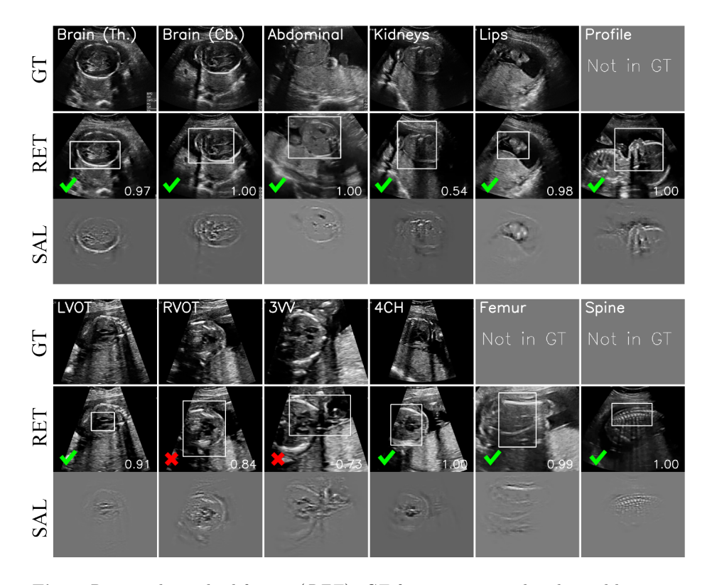
Fig. 2. Retrieved standard frames (RET), GT frames annotated and saved by expert sonographers and respective saliency maps (SAL) for one volunteer. Correctly retrieved and incorrectly retrieved frames are denoted with a green check mark or red cross, respectively. Frames with no GT annotation are indicated. The confidence is shown in the lower right of each image. The results of the our proposed fetal anatomy localisation approach are shown as white boxes in the RET rows.