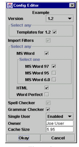
Figure 2: Configuration Editor

The install agent performs its task by first retrieving the current DSD specification for the software family for which it is responsible. The install agent queries the local field dock and the user to determine the configuration of the software release to install [see Figure 2]. Once a configuration is determined the install agent only needs to perform the actions associated with all of the applicable schema elements for the selected configuration, such as testing assertions, resolving dependencies, and retrieving Once the install artifacts. process is complete, the install agent is no longer needed and therefore it re-