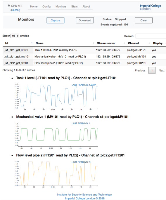
Fig. 2: CPS-MT real-time monitors [2]