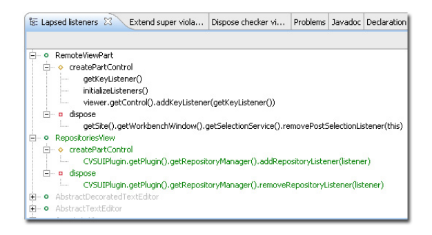
Figure 6: Output of the lapsed listener checker. For each method, calls in green are matched; others are potential mismatches.

Event listeners in Java GUI programs is another common source of memory leaks. Event listeners are a common way to specify actions that should occur when a user interface event such as a mouse click occurs on a given GUI component. This is achieved by registering a listener with a GUI component; when the component is destroyed, the listener should be unregistered . If a listener is not unregistered, it will preserve a link to the GUI component. The listener is reached from a global listener table, thus making the potentially large GUI component also reachable and therefore considered live by the garbage collector. This error pattern is referred to in the literature as the lapsed listener problem [14]. Lapsed listener errors are quite prominent in Eclipse: our searches on bugs.eclipse.org revealed at least 92 bugs in this category. The number of lapsed listener bugs reported for each development milestone shown in Figure 5.