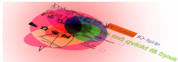
Figure 2: Example of a rendered picture following the canvas fingerprinting test instructions.

IQ-hjälp ” and “ Gud hjälpe Zorns mö qvickt få byxa ”. They contain most of the letters found in the alphabet and we added special characters in them. For the first string, we force the browser to use one of its fallback fonts by asking for a font with a fake name. Depending on the OS and the fonts installed on the device, fallback fonts may differ from one user to another. For the second line, the browser is asked to use the Arial font that is common in many operating systems. Then, we ask for additional strings with symbols and emojis. All strings, with the addition of a rectangle are drawn with a specific rotation. A second set of elements is rendered with four mathematical functions: a sine, a cosine and two linear functions. These functions are plotted on a specific interval and using the PI value of the JavaScript Math library as a parameter. The third and final set of elements consists in drawing a set of ellipsis. These figures are drawn with different colors and with different levels of transparency. Since filters for opacity change among browsers, it creates differences between them. One of these ellipsis is overlapping the canvas element, and it is filled with a transparent radial gradient. Figure 2 displays an example of a canvas rendering following the instructions of our script.